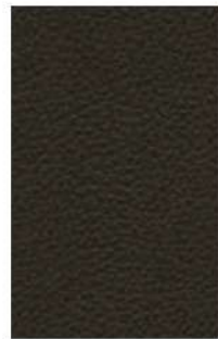
CHOCOLATE (SYNTHETIC LEATHER)