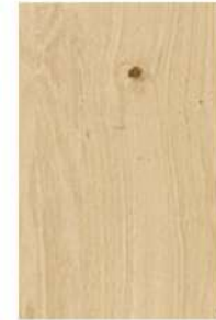
OAK WITH KNOT