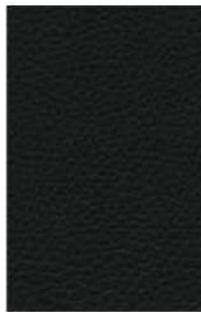
BLACK (SYNTHETIC LEATHER)