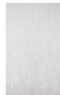
STAINLESS STEEL BRUSHED

METAL THICKNESS 2MM BRUSHED OR ANODIZED FINISH