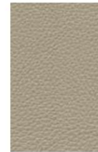
MASTIC (SYNTHETIC LEATHER)