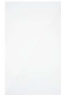
SILVER PEARL GLOSSY