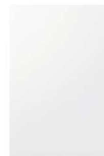
NATURAL ALUMINIUM ANODIZED