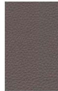
TAUPE (SYNTHETIC LEATHER)