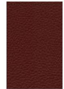
MORGON (SYNTHETIC LEATHER)

SYNTHETIC LEATHER LAMINATED ON ACRYLIC GLASS THICKNESS 3MM