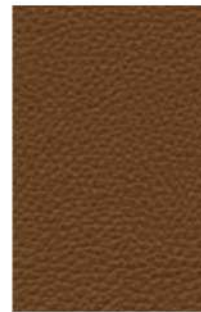
CHESNUT (SYNTHETIC LEATHER)